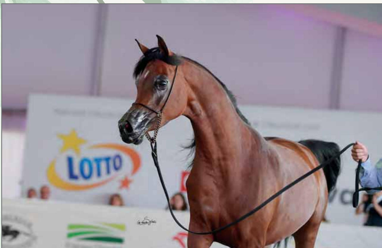
Petula (Kahil Al Shaqab x Pinga)

Even though no longer with us, some horses can never be forgotten. As a true ambassador of the Arabian breed, Pinga was surely one of those extraordinary horses who show the world how amazing and versatile Arabian horses truly are. Beautiful inside and out, this magnificent mare was so much more than a successful show champion and a prolific broodmare. She was the symbol of powerful femininity