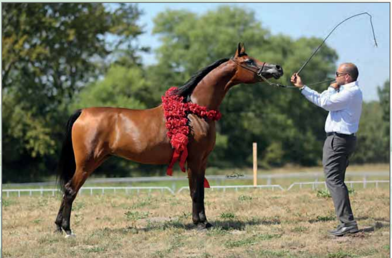
Piniata (Eden C x Pinga)