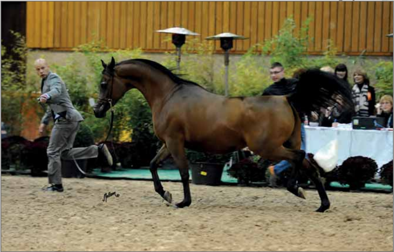
Pinga's amazing performance at the 2012 European Championships in Moorsele

Both beautiful snow-white greys, the former is mostly known as the dam of the World Champion Stallion Piruet (by Probat), while the latter made the Szamrajowka family famous around the world. Not only was Pilarka a superb show horse, winning the laurels of the Polish, European and World Champion Mare, but she also became a proven producer for Janow Podlaski, where she gave birth to two exceptional daughters. One of them was the precious Pinia (by Probat), the dam of Pianosa (by Eukaliptus) who, bred to Gazal Al Shaqab, produced the unforgettable Pianissima. The other one was the incomparable Pipi (by Banat), another outstanding producer who crossed extremely well with the 1982 Junior World Champion Fawor. This cross resulted in three full siblings: the Polish National Junior Champion Colt Pilot, the amazing broodmare Pilica, who is the dam of Palmeta by Ecaho and, last but not least, the Polish National Junior Champion Filly Pilar. Following in the footsteps of her prolific dam, Pilar, at the age of fourteen, was already a proud mother of ten get; eight mares and two stallions. Half