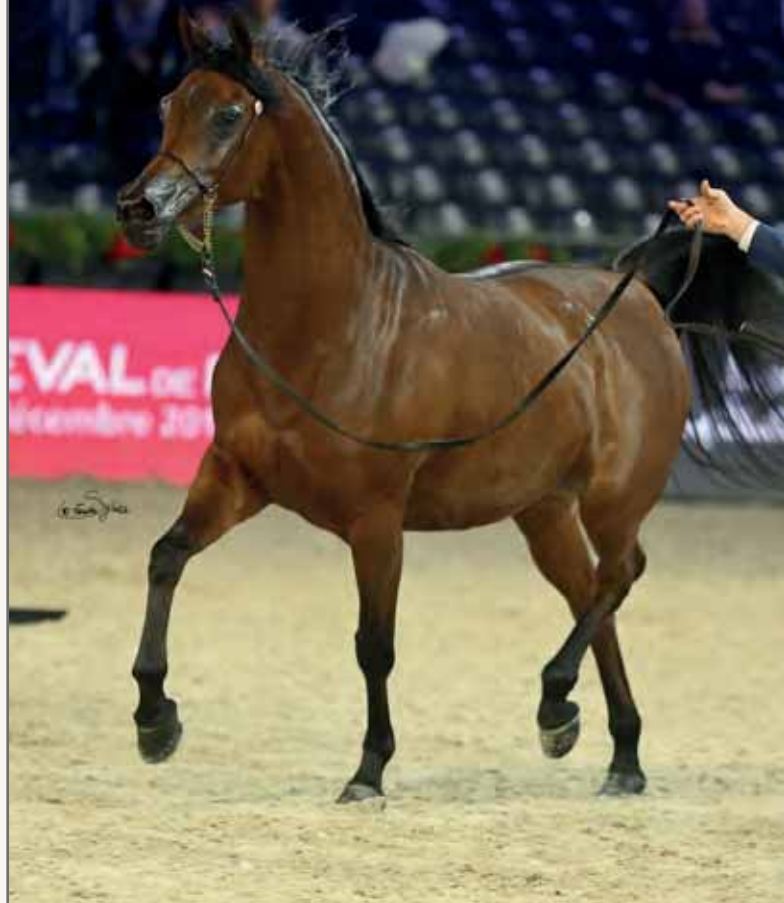
Pinga in Paris, trotting for the Platinum World Champion Mare title in 2015