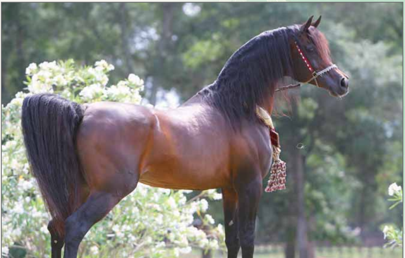
Gazal Al Shaqab (Anaza El Farid x Kajora)