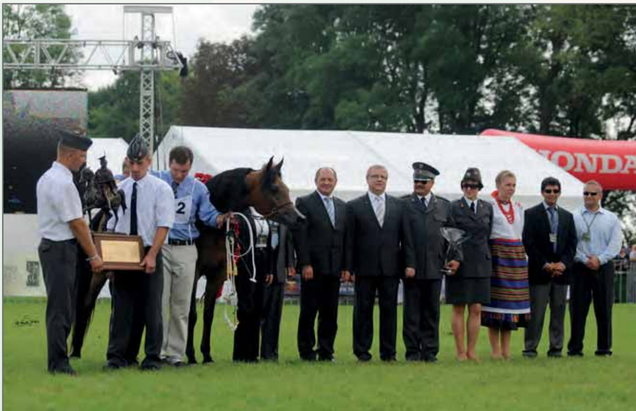
Pinga at the 2010 Polish National Show in Janow Podlaski