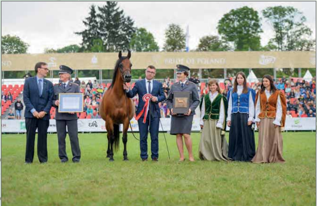
Pinga at the 2017 Polish Nationals, collecting a well-deserved WAHO Trophy

started shortly after she returned home from the USA in 2010, when, at the Polish Nationals, she repeated her own success from 2005, this time as a senior mare. With another spectacular score of 93.67 points, Pinga was crowned the Polish National Champion Mare, winning also the Best in Show title. However, that again was only a warm-up before conquering Europe. In